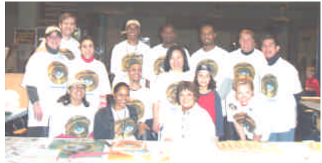
E-Week volunteers present their wares to the event audience

National Engineers Week is celebrated annually in February throughout the country to recognize engineering of all disciplines. In New Jersey, the Liberty Science Center conducts special activities all week long. ASCE's NJ Section, has been a key participant there for many years, hosting a variety of interactive exhibits and hands-on activities. Normally, thousands of kids show up at the LSC as it serves as a great outreach to future engineers.